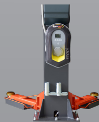
EV Charging Station