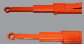
EAE Low Profile Arm