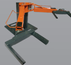
Tyre Holder Adapter