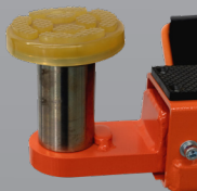
Screw Pad / 4WD Adapter