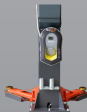
EV Charging Station