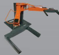
Tyre Holder Adapter