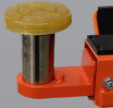
Screw Pad / 4WD Adapter