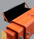
Arm Tool Tray