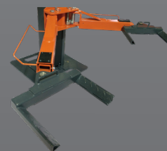
Tyre Holder Adapter