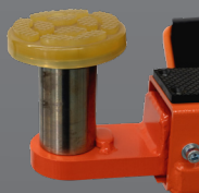
Screw Pad / 4WD Adapter