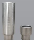
8 Piece Pad Adapter Set