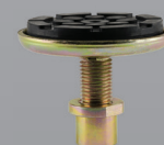
Combination Screw Pads