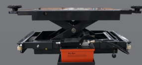
RJ70 Rolling Jack