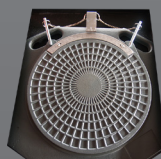
EAE Turntable Set