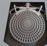
EAE Turntable Set