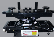
RJ45 Rolling Air Pump Jack