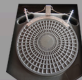
EAE Turntable Set