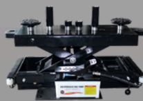
RJ45 Rolling Air Pump Jack